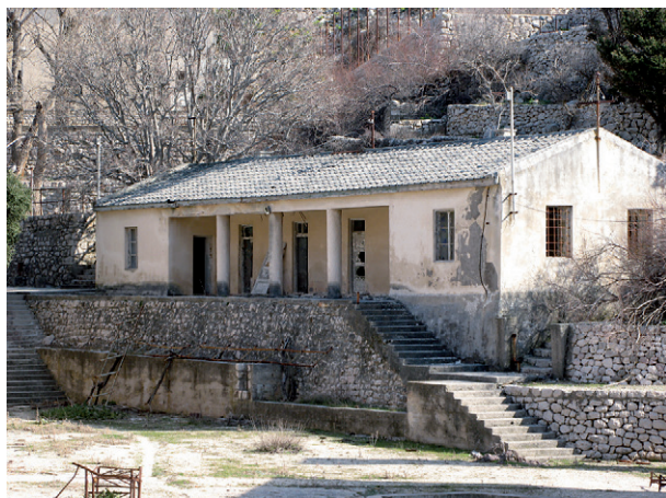
Photograph: Darko Bavoljak

The Goli Otok camp had a peculiar administrative structure. The UDBA, the Yugoslav secret police, was itself almost never present within the camp. It established a system of camp self-administration where privileged inmates controlled the other convicts. An entire system of privileges and internal hierarchy among inmates was established to function as a lever of "political re-education". The building that housed the Centre, the highest level of the camp's self-administration, is one of the few authentic camp buildings in the Wire. Here, the camp's self-administration bosses would coordinate tasks received from the UDBA, implementing work plans or accepting inmates and collaborators. This place was especially hated by the camp population, as the prisoners knew very well that the obedient inmates housed at the Centre were the long arm of the UDBA. The Centre leadership enjoyed many privileges that common inmates could only dream of: beds, unlimited food and drink, even alcohol. They did not need to work, but they made others work. Incidentally, similar organisational models, with inmates having authority over other inmates on behalf of the authorities, could be found in Nazi prison camps, as well as in the Soviet Gulags.