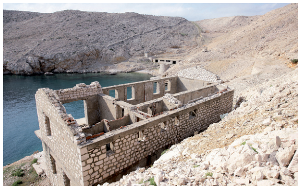
The remains of the women's camp on Goli otok.

Afterwards, the women were moved to the camp on Sveti Grgur island, where they spent about a year, from April 1950 until April 1951, after which they were transferred to Goli Otok, to a camp named Radilište 5 (Worksite 5, R-V). Here again they spent a year. During this time, although they shared the island with men, they had no contact with them. According to former inmates' testimonies, the two groups only occasionally sighted each other from afar. The women's camp on Goli Otok was situated at a particularly inaccessible location, with particularly severe weather conditions as it was exposed to constant bursts of wind. Similar to the administration structure of the male camps, the interrogators were women, and the living and working conditions were hard. After Goli Otok, the inmates were transferred back to the neighbouring island, Sveti Grgur, where they saw the dismantling of the camp system and their own return to freedom.