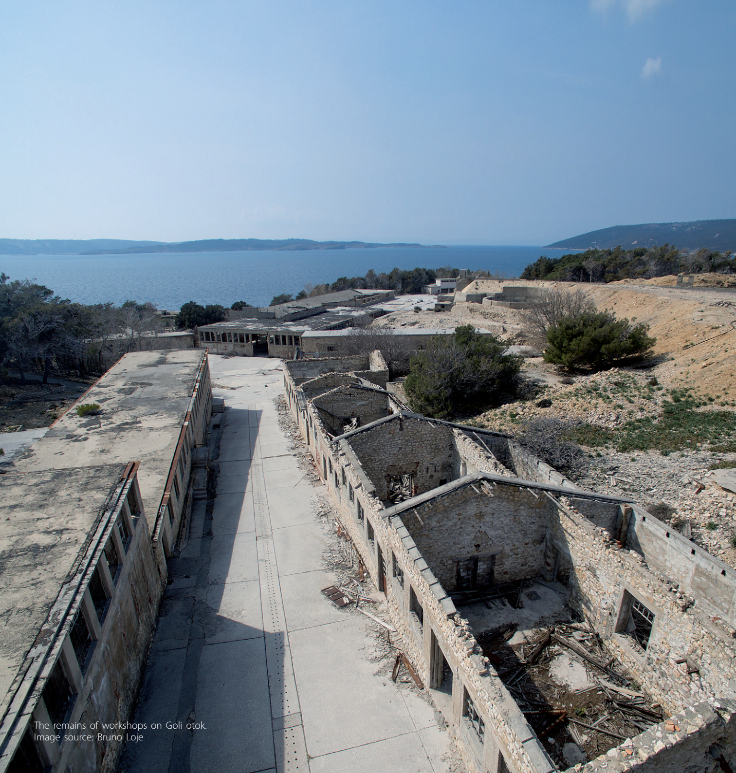
The remains of workshops on Goli otok.